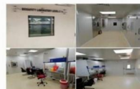
DBT_ILS Bhubaneswar COVID 19 testing facility

DBT-ILS Retweeted BiotechIndia @DBTIndia · Apr 16 @DBTIndia 's AI @DBT_ILS Bhubaneswar started testing for COVID 19 after due approval of @DBTIndia and @ICMR. The testing is being conducted using its newly commissioned BSL3 laboratory. @drharshvardhan @RenuSwarup @MoHFW_INDIA @HFWOdisha @DBT_ILS